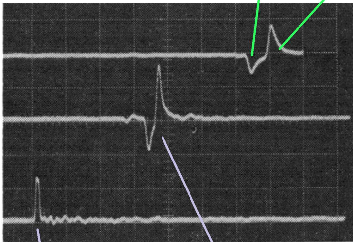
Fig. 29. Passive line. Third trace: front end of line. Second trace: 120 inches down line. First trace: 234 inches down line.

This middle trace has a HIGHER positive peak than the 3rd trace,